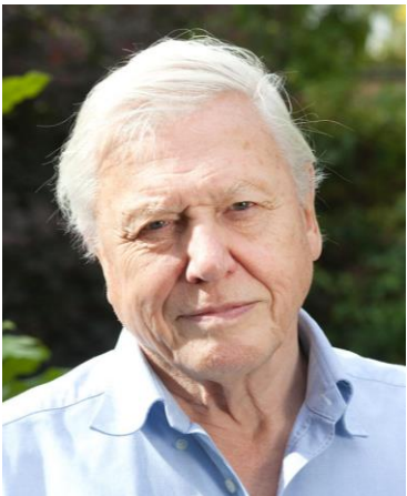
Sir David Attenborough

Use YouTube or another platform to watch some videos of the named celebrities. What do you notice about the way they speak? Note down three skills you think they have'