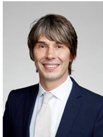
Professor Brian Cox